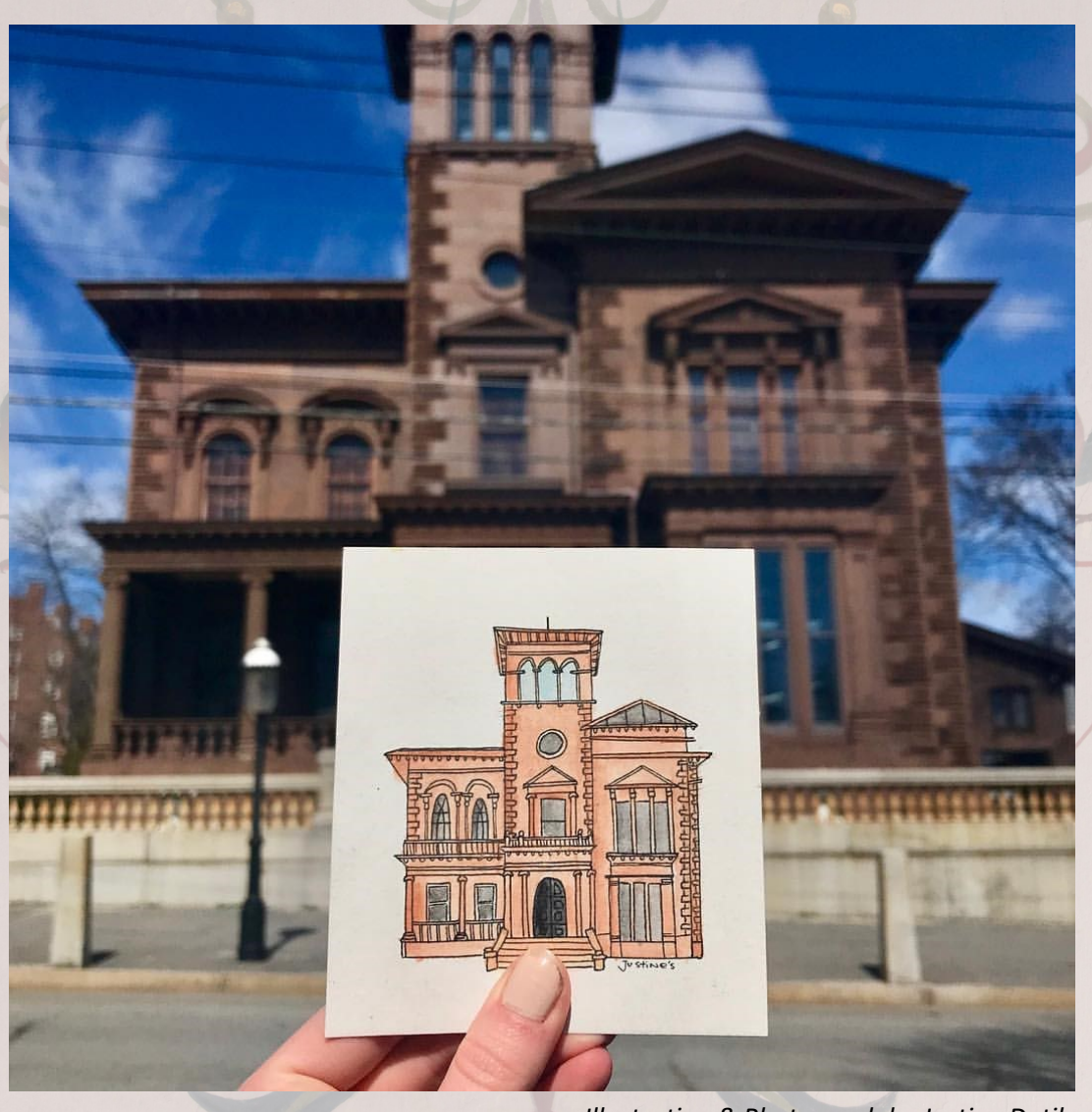
Illustration & Photograph by Justine Dutil