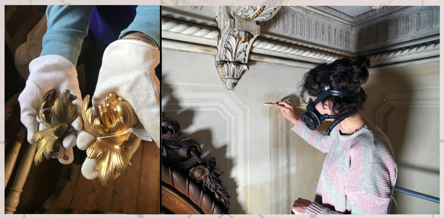
Photographs by Gianfranco Pocobene

For more information, visit <u>www.victoriamansion.org/learn/</u> <u>preservation-conservation-and-restoration/</u>